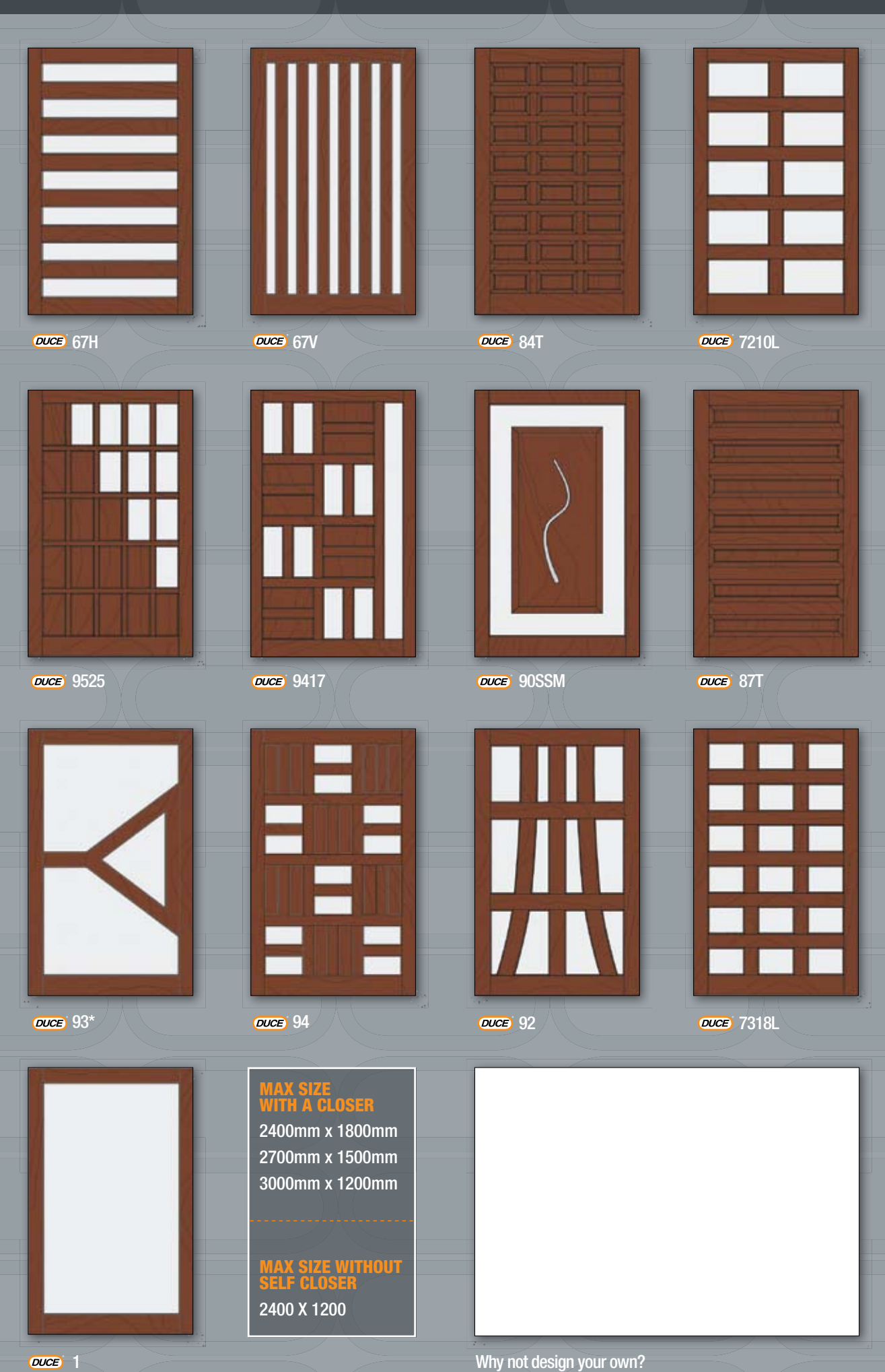
Why not design your own?